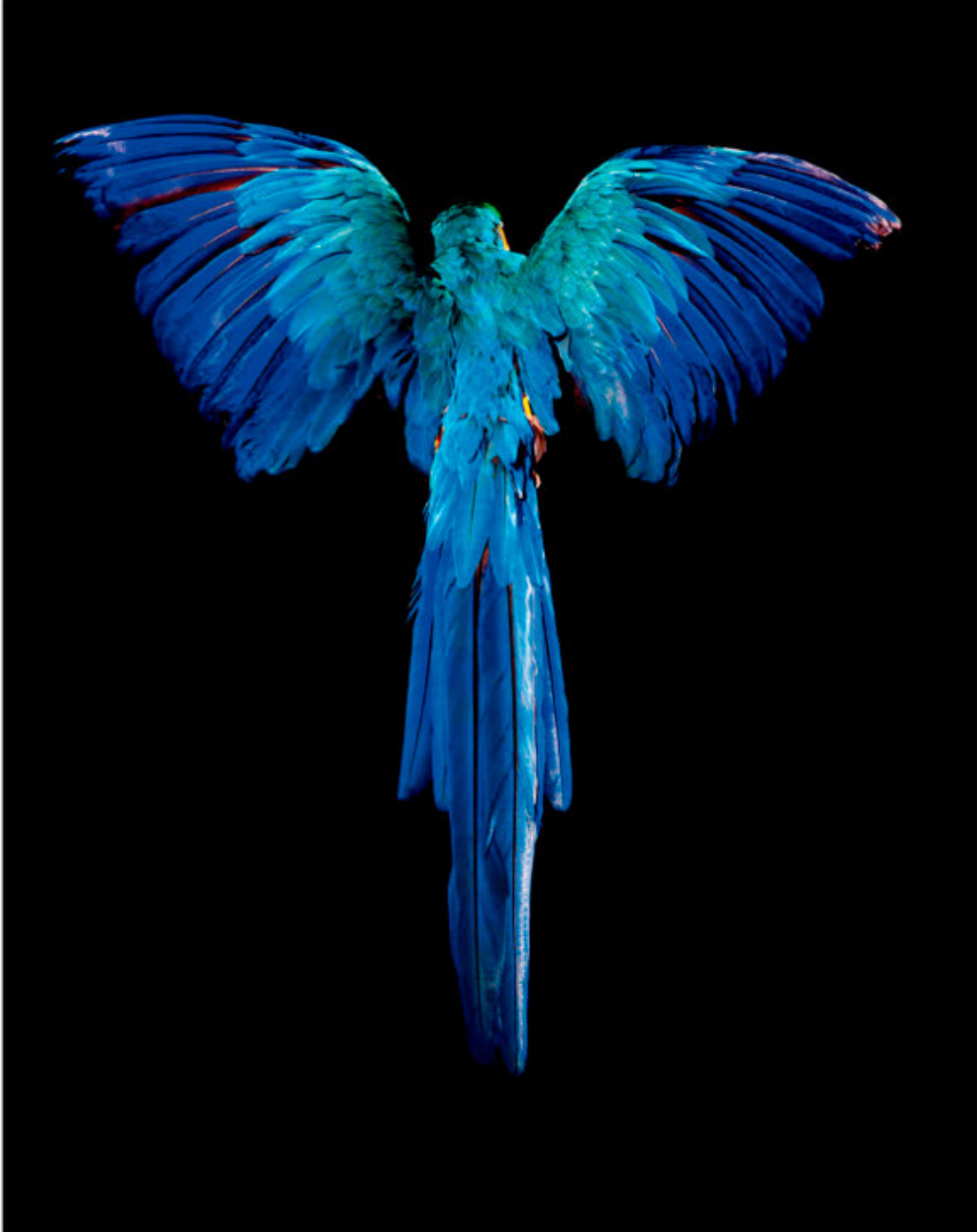
Pride and Glory Macaw