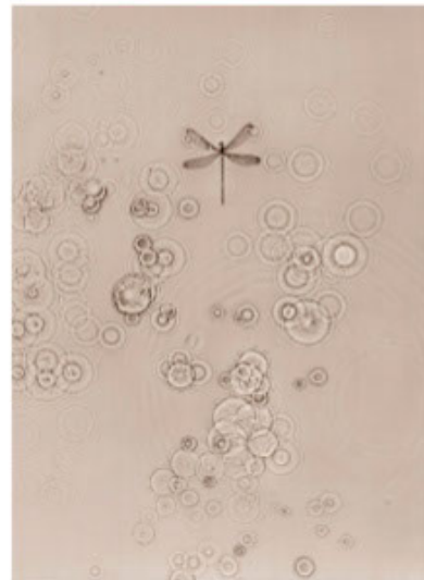
Fade into Light IV