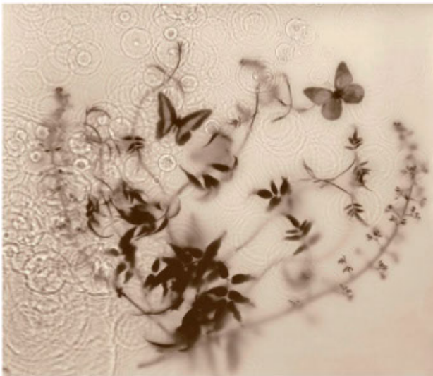
Fade into Light VII

His imagery complements some of the most dynamic of interiors worldwide and his work has been exhibited and collected internationally. He lives and works in London. [PM]